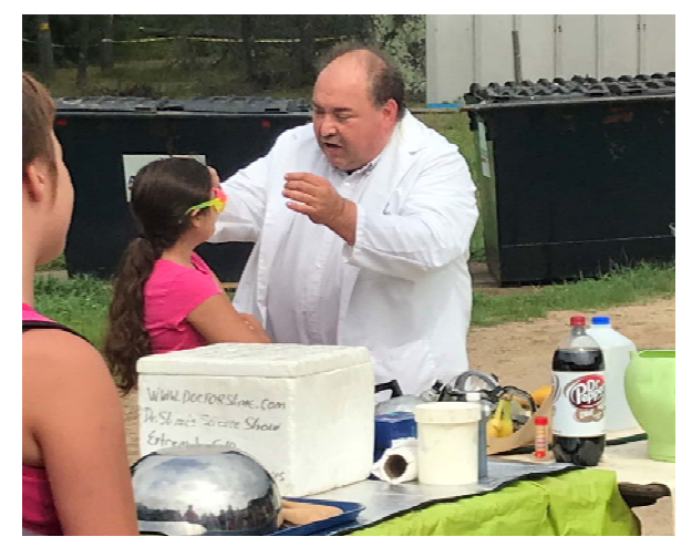
"Dr. Slime" at Community Outreach Day in Leota. MSU Extension provided nutrition education and physical activities for the kids.

"Mock Interview Day" offers students the opportunity to practice interview skills and network with the business community. Students are expected to bring a completed resume, job application or portfolio, and dress appropriately for an interview. Students receive individual feedback from volunteers. They become more prepared for job-seeking as a result of this experience. MSU Extension works with Clare County youth at Harrison High School to prepare for this event held annually at Mid Michigan College in Mt Pleasant.