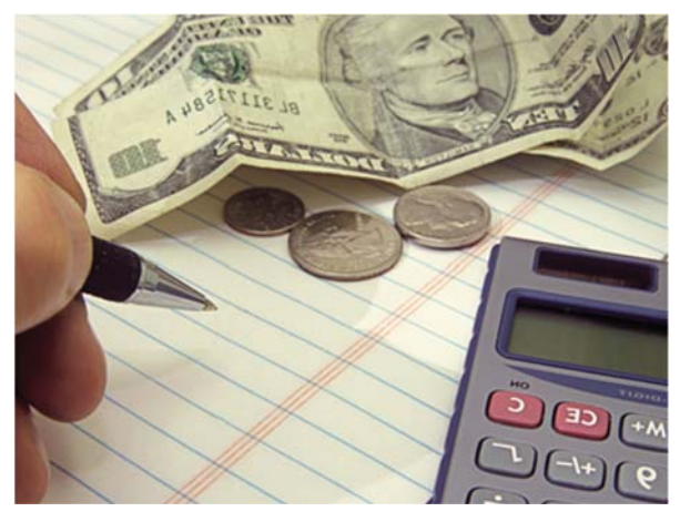
Budgeting classes help residents understand their limited resources and provide skills to help plan for homeownership.