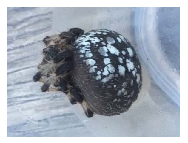
One of the many insect samples brought into the Extension office for identification.